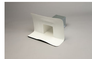
Thru Wall Scupper