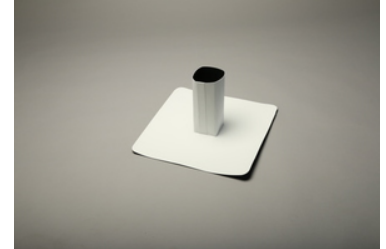
Square Tube Wrap